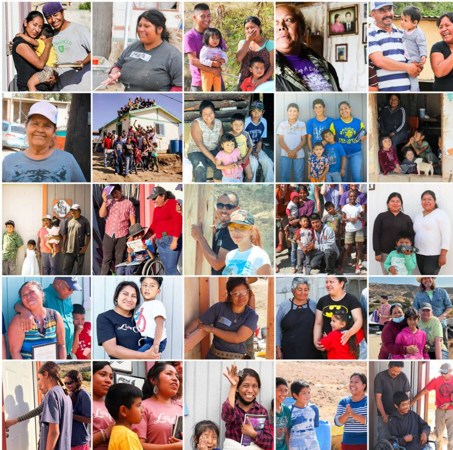
Every photo is a beautiful reminder of a family who has hope.